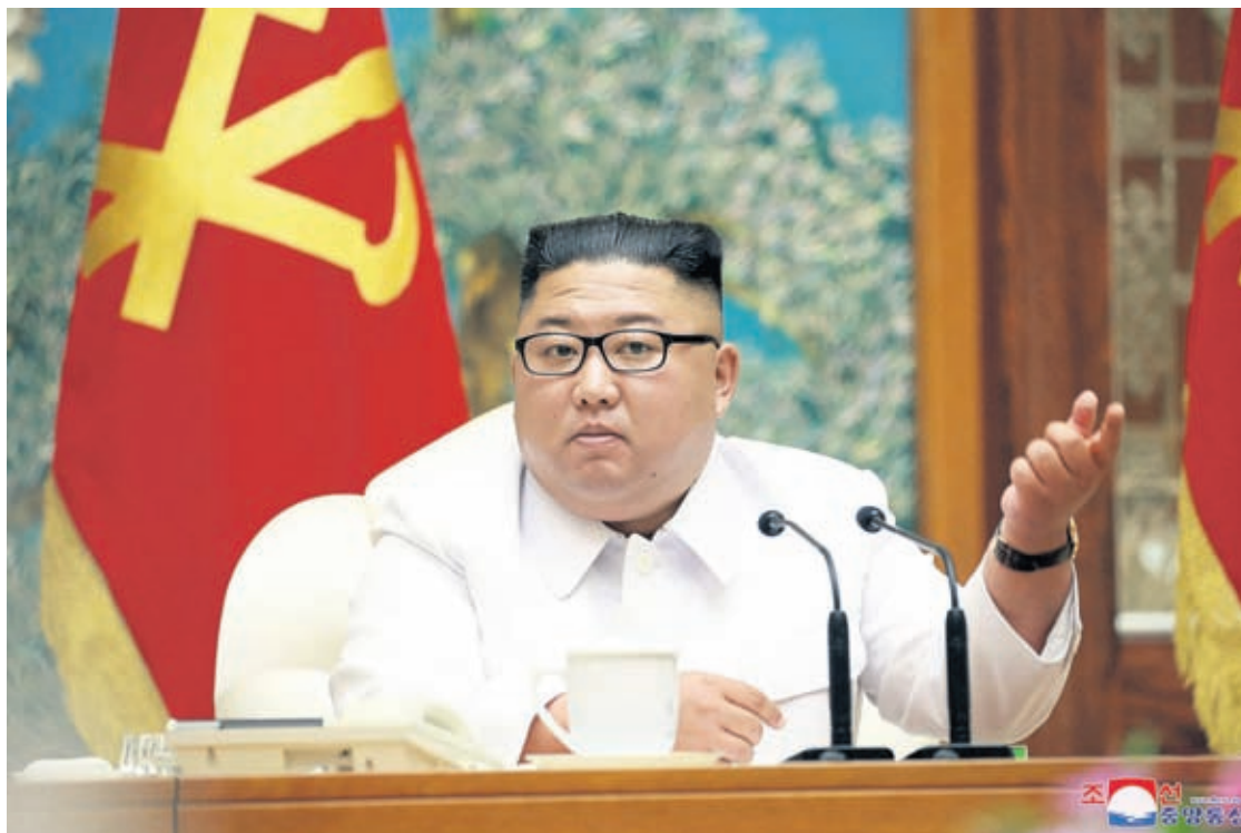
In this photo provided by the North Korean government, North Korean leader Kim Jong Un attends an emergency Politburo meeting in Pyongyang, North Korea Saturday, July 25, 2020.

KCNA said respiratory secretion and blood tests showed the person "is suspected to have been infected" with the coronavirus. It said the person was placed under quarantine. People who had been in contact with the suspected patient and those who had been to Kaesong in the last five days were also quarantined.